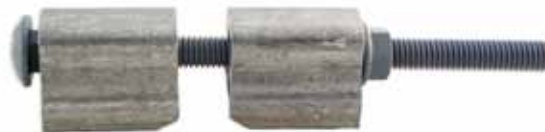
BAND-IT® Bolt Clamp - 1-1/4"