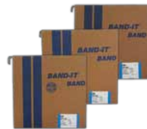
Giant Band 3/4" (G43099), 1" (G43199) and 1 1/4" (G43299)