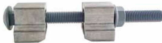
BAND-IT® Bolt Clamp - 3/4"