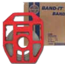
201 Stainless Steel BAND-IT® Band in Box (C20699) or Tote (C206R9)